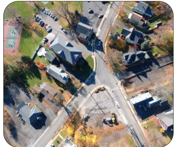
Gracie's Kitchen, The American Legion Post, and Voorheesville Village Hall, as well as the future home of the Blackbirds Cafe, as seen from above.