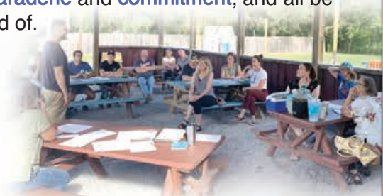
* Our New Scotland Business leaders meet locally at different businesses in town each month to talk and resolve common growth goals.

Now, with a “Core” leadership team, we are doing just that. So it continues, ten months later, we have set some of the corner stones of what will decidedly become something our community of businesses and residents can participate in; learn and grow in; camaraderie and commitment ; and all be proud of.